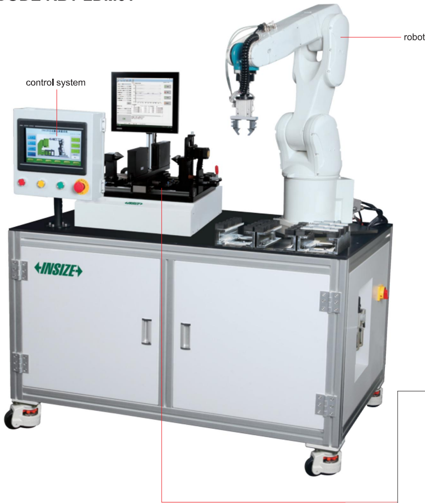
automatic laser scan micrometer LDM-AT01